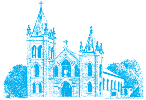
St. Gabriel Archangel

Please join us for a recep- tion following the Mass.